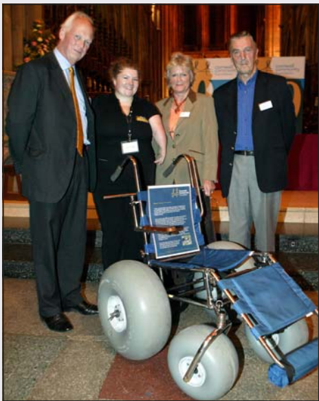
Funded by the Friends of the Community Foundation and the Quinnian Trust, two new Sand Chairs will be based in St Mary's and Polzeath next summer.