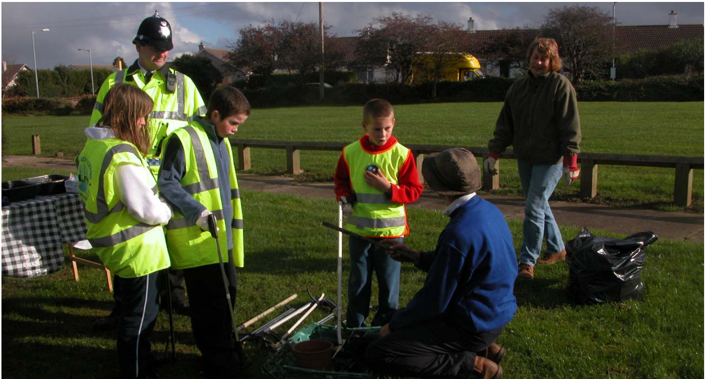
Community Assisted Projects - Community Action Day at Illogan